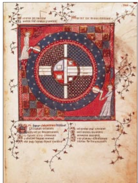
Angels make the universe turn—and time moves on

Of 3393 patients with a bloodstream infection, 1691 patients were randomised to the intervention group and 1702 to the control group. No patients were lost to